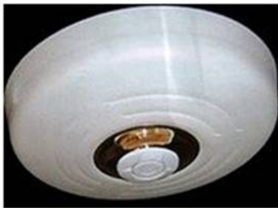
C:\Users\MCS\Desktop\1.jpg Heat Detection System

Smoke, heat, and carbon monoxide detectors