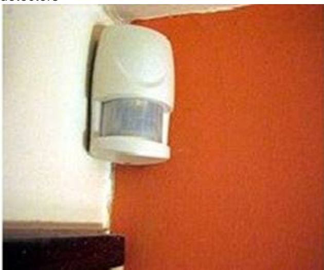
C:\Users\MCS\Desktop\1.jpg Passive Infrared Sensor

These types of sensors are designed for indoor use. Outdoor use would not be advised due to false alarm vulnerability and weather durability. Passive infrared detectors